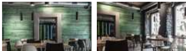
Colour and architec... Entrance halls